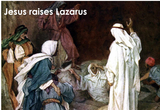
Jesus raises Lazarus

The sacraments engage all the senses, not just intellect and