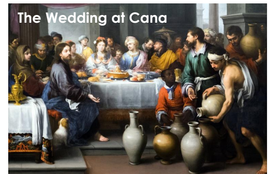
The Wedding at Cana